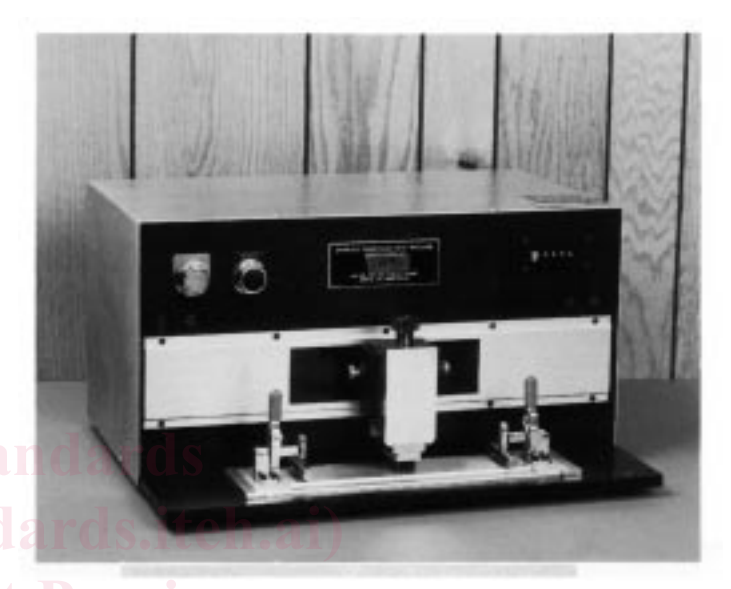
FIG. 1 Granule Adhesion Test Apparatus