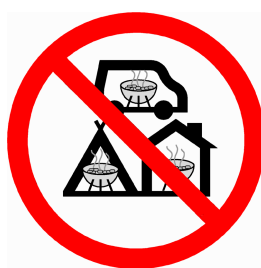
Figure 13 — Graphical symbol for warning notice

"Do not use the barbecue in a confined and/or habitable space e.g. houses, tents, caravans, motor homes, boats or other confined space. Danger of carbon monoxide poisoning fatality."