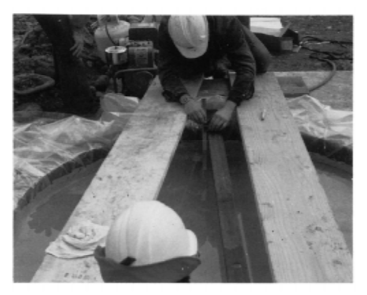
FIG. 3 Measuring the Water-Level Reference with a Carpenter's Square

10.8.6 Remove the water in the template, and remove the liner.