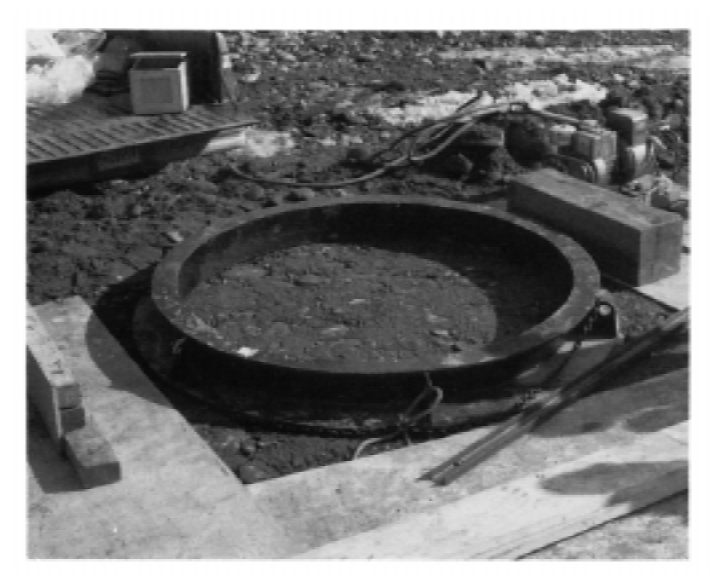
FIG. 1 A 6-ft (1.8-m) Diameter Metal Ring for Determining In-Place Unit Weight

6.6.1 Since it may be difficult to place the template exactly level, particularly with 6-ft (1.8-m) and larger diameter rings, the height of the template should accommodate a slope of approximately 5 %. Since the water level has to be below the