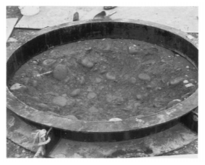
FIG. 4 Test Pit During Excavation

10.10.2 If the volume of water is being measured, set the water-measuring device indicator to zero or record the initial