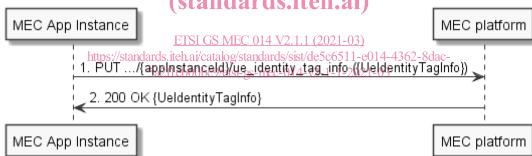
Figure 5.2.2-1: UE Identity tag registration

Figure 5.2.2-1 illustrates the message flow for the UE Identity tag registration procedure. The tag is used in UE Identity feature.