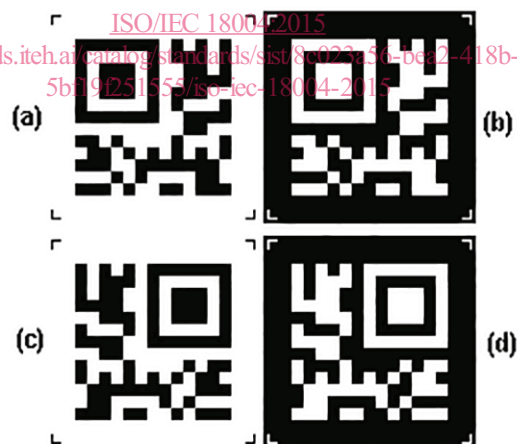
Figure 2 — Examples of Version M2 Micro QR Code symbol encoding the text “01234567” - (a) normal orientation and normal reflectance arrangement; (b) normal orientation and reversed reflectances; (c) mirror image orientation and normal reflectance arrangement; (d) mirror image orientation and reversed reflectances

NOTE The corner marks in Figures 1 and 2 indicate the extent of the quiet zone.