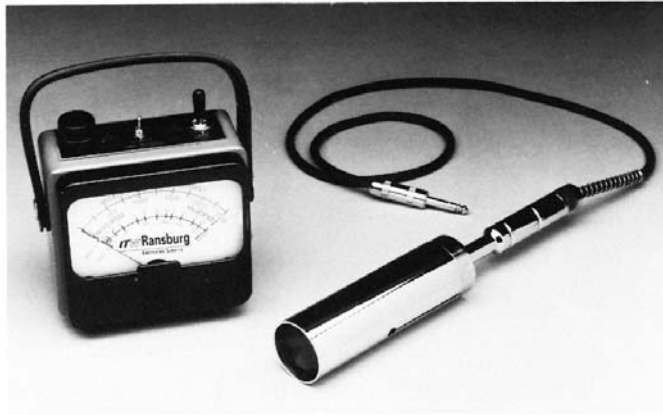
FIG. 1 Analog Paint Application Test Assembly