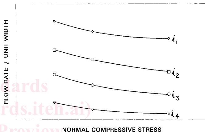
FIG. 3 Typical Plot of Flow Rate per Unit Width Versus Normal Compressive Stress at Several Hydraulic Gradients

NOTE 7—The calculation of the hydraulic transmissivity is applicable only for tests or specific regions of tests conducted under laminar flow conditions. To determine the flow regime, plot the flow rate per unit width versus the hydraulic gradient for each normal compressive stress (see 10.2 and Fig. 2). The data points for a given normal compressive stress form a straight line intersecting the origin if the test, or a region of the test, was conducted under laminar flow conditions. The hydraulic transmissivity is equal to the slope of the straight line region on these plots (see Appendix X1).