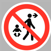
Figure 1 — Never leave the child unattended