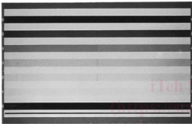
FIG. 1 Practical Opacity Chart in Accordance with Footnote 5 and Appendix X1

7.1 Practical Opacity Charts —These are smooth surface, sealed paper test charts on which are printed a 6-step series of grey stripes of increasing darkness numbered from 1 to 6. The test area is 6 ft 2 (5575 cm 2 ). For more complete details see Fig. 1 and the manufacturer's description in the appendix. 3