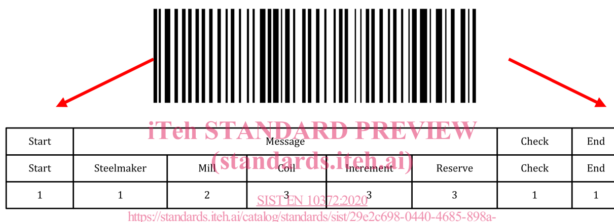
Figure 2 — Description of the 1D barcode structure used for the Quality Tracking application indicating the symbology of numbers per segment of the message

The structure of the 1D barcode in symbology code 128 (Figure 2) consists of a start number, then a series of numbers for the message, a check number which allows for the verification of the barcode content and the correction of small reading errors and an end number (of which its total width is equal to 13 elementary widths with 7 bars). The start number, the check number and the end number are automatically derived from the selected symbology. For Quality Tracking application, the useful message consists of 9 or 12 numbers. Then, the length of the printed 1D barcode consists of 12 or 15 numbers respectively, either 134 or 167 elementary widths.