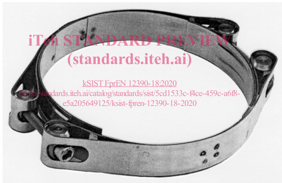
Figure 3 — Stainless steel sleeve clamp