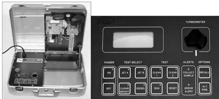
FIG. 2 Mark X Micro-Separometer and Control Panel

7.1.9 By depressing the appropriate ARROWED push button, the displayed value on the meter can be increased/decreased, as required, to establish the 100 reference level for the vial of filtered fuel sample in the turbidimeter.