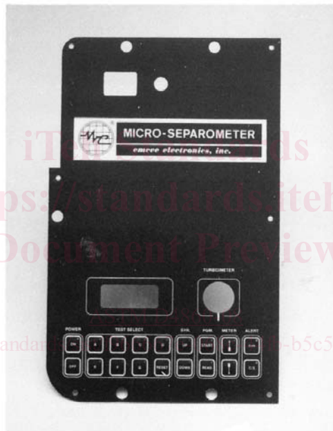
FIG. 1 Mark V Deluxe Micro-Separometer-Mark V-Deluxe and Control Panel