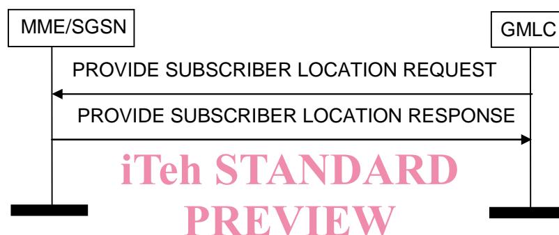
Figure 6.2.2-1: Provide Subscriber Location procedure. Successful operation.

The GMLC initiates the procedure by sending a PROVIDE SUBSCRIBER LOCATION REQUEST message to the MME or SGSN. This message carries the type of location information requested (e.g. current location and optionally, velocity), the UE subscriber's IMSI, LCS QoS information (e.g. accuracy, response time), an indication of whether the LCS client has the override capability, and an indication of whether delayed location reporting for UEs transiently not reachable (e.g. UEs in extended idle mode DRX or Power Saving Mode) is supported as specified in clauses 9.1.6 and 9.1.15 of 3GPP TS 23.271 [2]. The message also carries an LCS reference number, if delayed location reporting is supported. For deferred MT-LR procedure, additionally, the message carries Deferred location type, LCS reference number, H-GMLC address, periodic LDR info, triggered LDR info, etc.