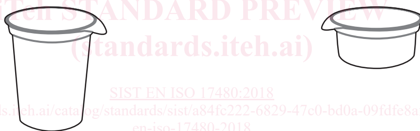
Figure A.4 — Heat-sealed semi-rigid containers

The opening tab large enough to pinch helps open the package easily.