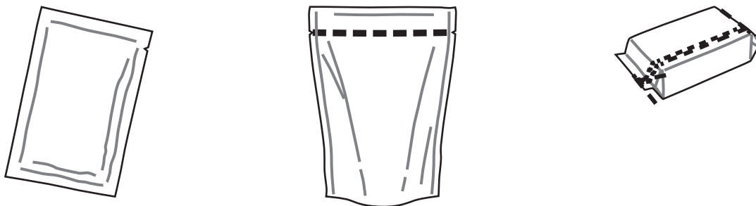
Figure A.2 — Heat-sealed flexible bags

Notch or perforation helps open the package easily with fingertips.