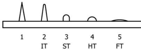
FIG. 1 Critical Temperature Points

5.1.1 The furnace shall be capable of maintaining a uniform temperature zone in which to heat the ash cones. This zone shall be such that the difference in the melting point of 12.7 mm [½ in.] pieces of pure gold wire when mounted in place of the ash cones on the cone support shall be not greater than 11°C [20°F] in a reducing atmosphere test run.