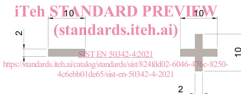
Figure 1 — Marking of polarity