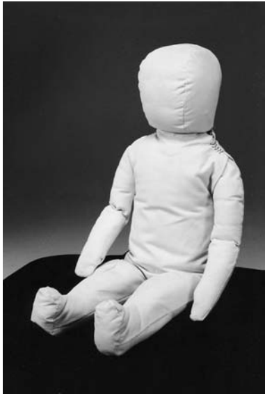
FIG. 1 CAMI Dummy, Mark II