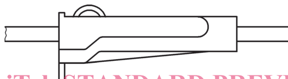
Figure 3 — Design of a flow regulator (known as roller clamp) (schematic)

iTeh STANDARD PREVIEW (standards.iteh.ai)