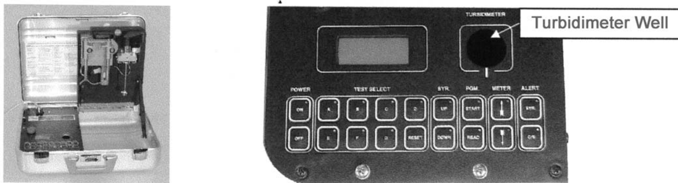
FIG. 1 Micro-Separometer Mark V Deluxe and Associated Control Panel