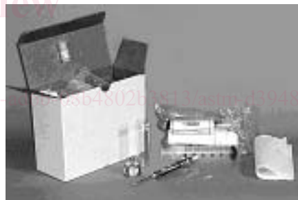
FIG. 4 Six Pack and Test Items

6.4 A new syringe, pipet tip, test sample vials, syringe plug, Alumicel coalescer, and distilled water are used in each test. These expendable materials are available in a kit, termed Micro-Separometer Six Pack, containing supplies for six tests (Fig. 4). 10