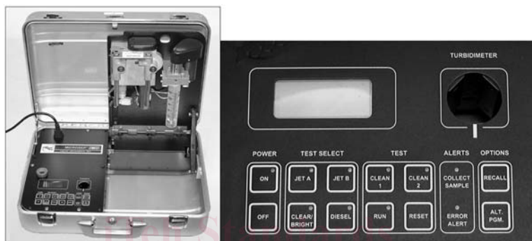
FIG. 2 Micro-Separometer Mark X and Associated Control Panel