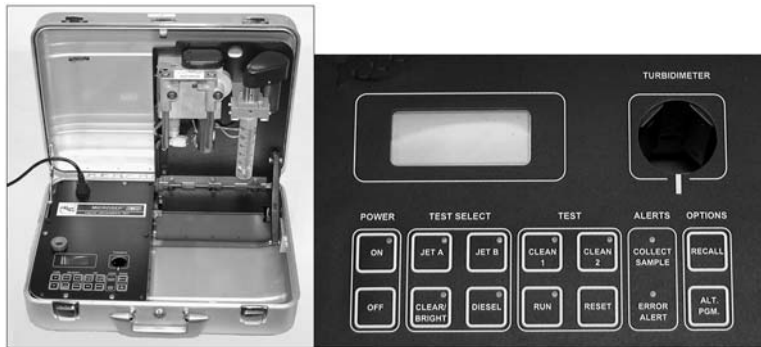
FIG. 2 Micro-Separometer Mark X and Associated Control Panel