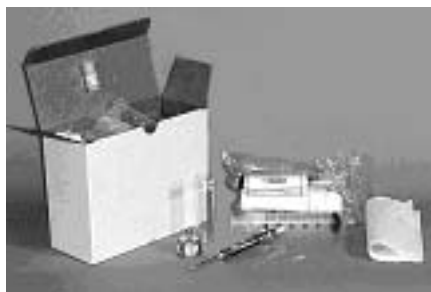
FIG. 3 4 Six Pack and Test Items