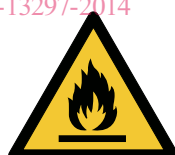
Warning; Flammable material ISO 7010 — W021