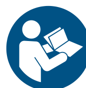
Refer to instruction manual/booklet ISO 7010 — M002