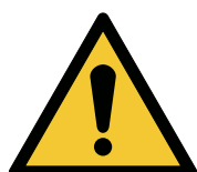
General warning sign ISO 7010 — W001

5.2 A permanently mounted waterproof warning sign shall be located at the panel board on the craft. The sign shall include the information shown in Figure 1a or Figure 1b .