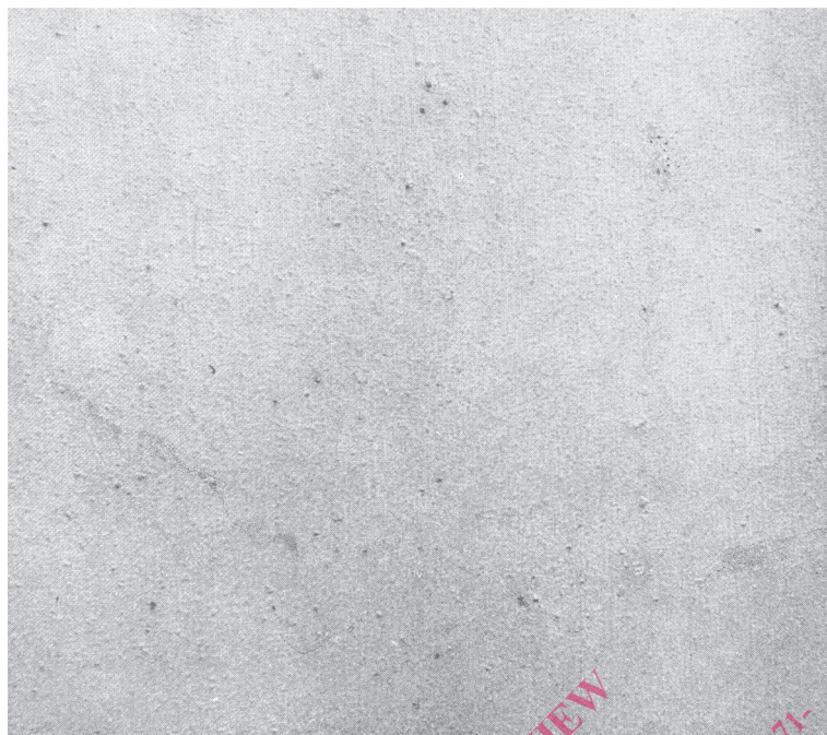
Figure 1 — Degree of rusting Ri 1