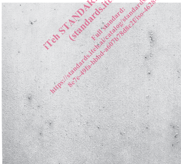
Figure 2 — Degree of rusting Ri 2