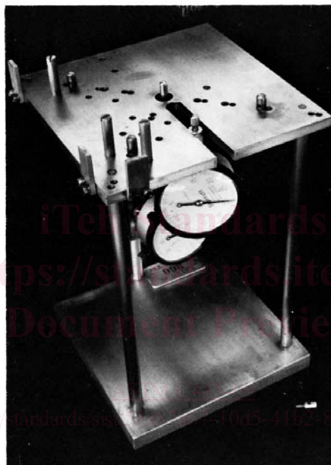
FIG. 1 Apparatus for Square Tile, Set Up for Measurement of 4¼- by 4¼-in. (108- by 108-mm) Tile

5.1 This test method provides a means for determining whether or not a lot of ceramic tile meets the warpage requirements that may appear in specifications to assure satisfactory tile installations. In accordance with this test method, warpage is calculated as a percentage of the length of the edge or diagonal being tested. It is realized that the percentage values based on the overall edge length, or on the overall diagonal length of a tile will be slightly lower than those based on the distance between reference points. However, the ratio of the overall lengths to the distance between reference points will be practically constant for any particular size of tile and, therefore, the percentage values will be comparable and equally indicative of warpage.