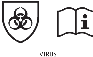
Figure 3 — Marking of gloves protecting against viruses, bacteria and fungi