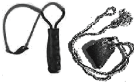
Figure 1 — Examples of slingshots (not within the scope of this part of ISO 8124)