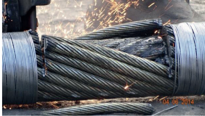
Figure 3 — Alternative serving and cutting method for large diameter rotation-resistant rope