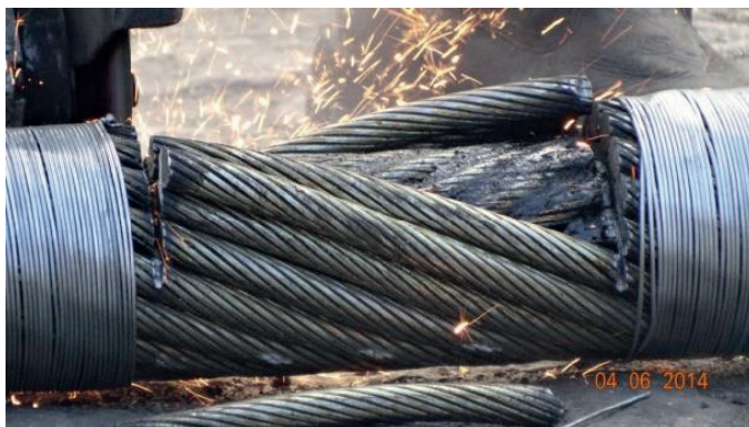
Figure 3 — Alternative serving and cutting method for large diameter rotation-resistant rope