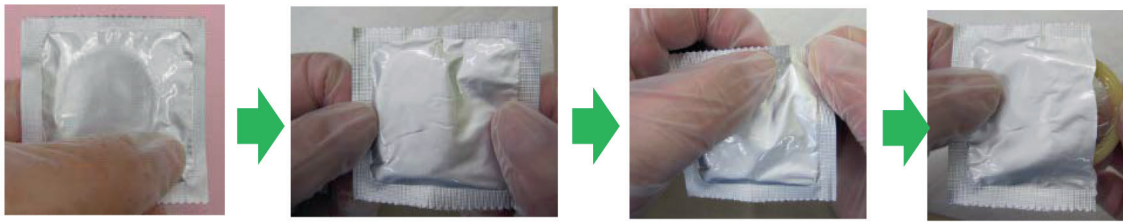
a) Procedures for unpackaging

4.3 The condom should be moved inside the individual container such that it is away from the area where the container is to be torn. This is to prevent the risk of damaging the condom when the individual container is torn open. Each individual container should be opened separately (see Figure 2 ).