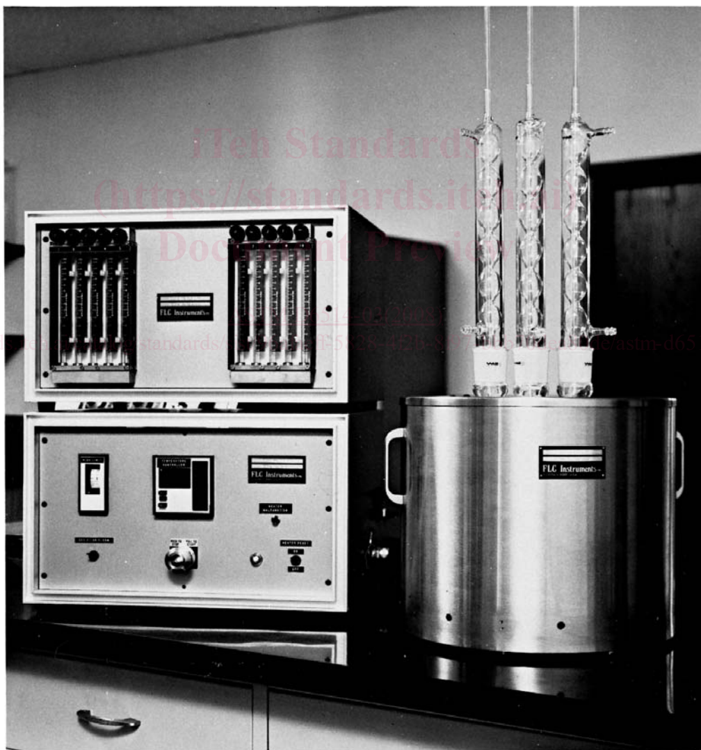
FIG. 1 Heating Block

6.1.2 Holes in the aluminum block to accommodate the test cells shall provide 1.0 mm maximum clearance for 38-mm