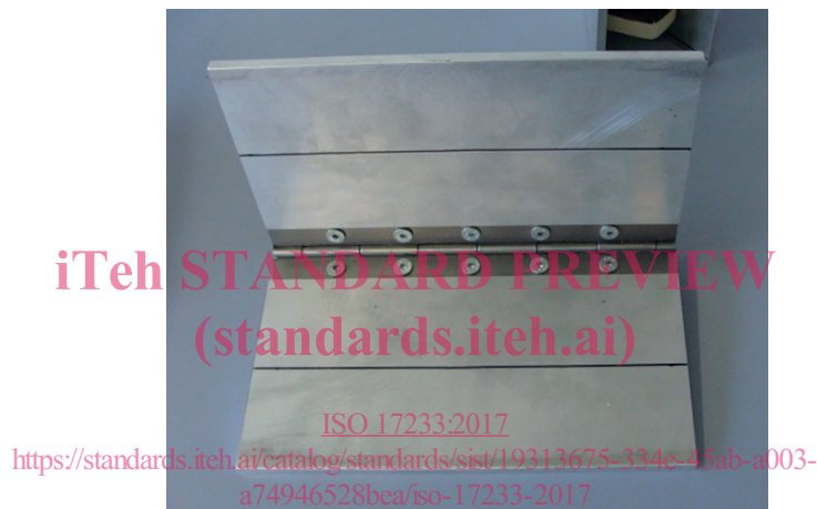
Figure A.1 — Step 1

Mark a line parallel to the hinge of the holder in a distance of 45 mm from the unhinged edge. See Figure A.1 .