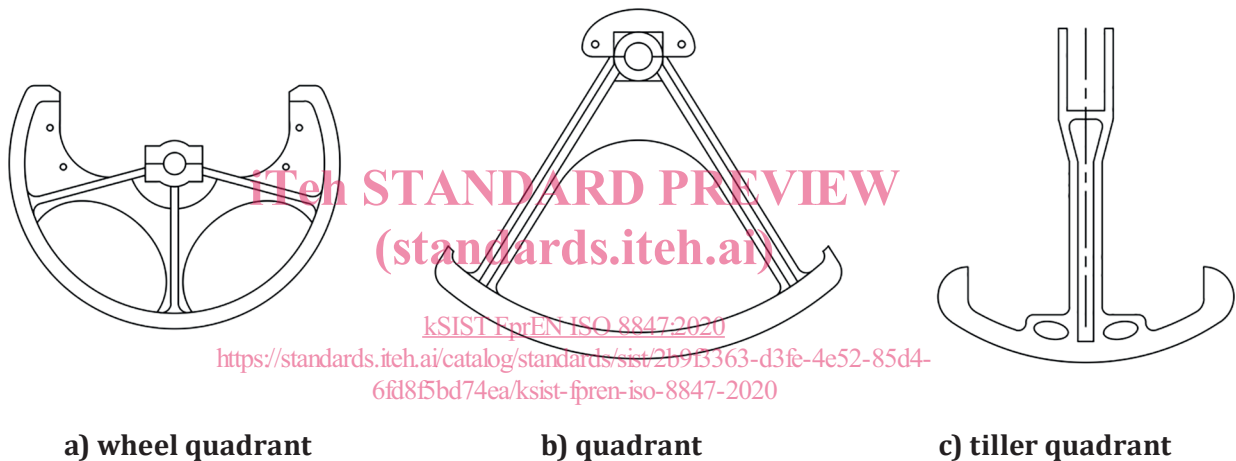
Figure 2 — Examples of steering arm types

Note 1 to entry: The steering arm may be a wheel quadrant (see Figure 2a ), a quadrant (see Figure 2b ) or a tiller quadrant (see Figure 2c ).