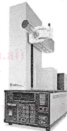
FIG. 2 Picture of Apparatus

6.1 Automatic Apparatus 4 —The automatic pour point apparatus described in this test method (see Fig. 2) consists of a microprocessor controlled measuring unit that is capable of heating the specimen to programmed temperatures, cooling the specimen according to programmed cooling profiles, mechanically manipulating the test jar according to the programmed test procedure, while optically observing the surface of the specimen for movement, using a camera system mounted on top of the specimen test jar and recording the temperature of