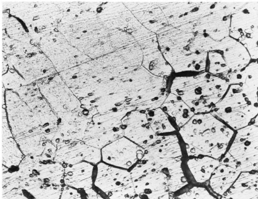
FIG. 3 Acceptable Structure Practice W—Oxalic Acid Etch Test Dual Structure Some Ditches But No Single Grain Completely Surrounded

15.10 During testing, there is some deposition of iron oxides on the upper part of the Erlenmeyer flask. This can be readily removed, after test completion, by boiling a solution of 10 % hydrochloric acid in the flask.