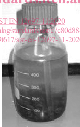
Figure 1 — Test bottle

STANDARD PREVIEW (standards.iteh.ai) SIST EN 12697-11:2020 https://standards.iteh.ai/catalog/standards-iteh/c7c80d88-3697-4da9-a1ea-9af598b9f617/sist-en-12697-11-2020