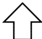
Figure 1 — Pictogram ISO 7000 – 1861 Indication for (vertical) alignment

If the knee system is not worn at the body, the marking below shall be used on the side facing the knee and pointing forwards.