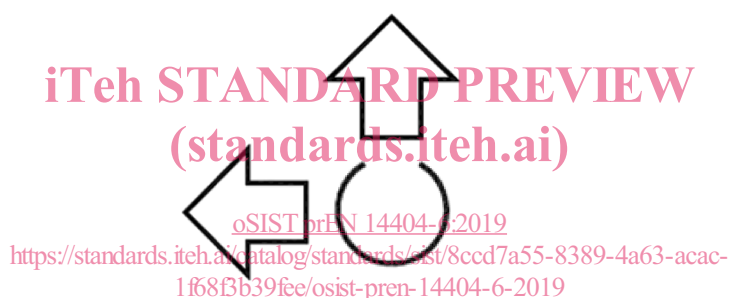
Figure 2: Pictogram ISO 7000 – 1861 +1140 + 0251 Marking of left knee side at which the knee protector is to be worn

When a differentiation is necessary to indicate the side of the body (left/ right) the additional marking (Figure 2 and Figure 3) shall be used respectively for the left knee and for the right knee.