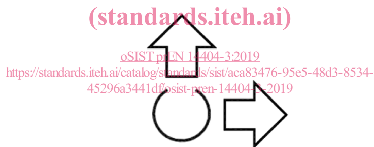
Figure 3 — Pictogram ISO 7000 - 1861 + 1140 + 0251 Marking of right knee side at which the knee protector is to be worn