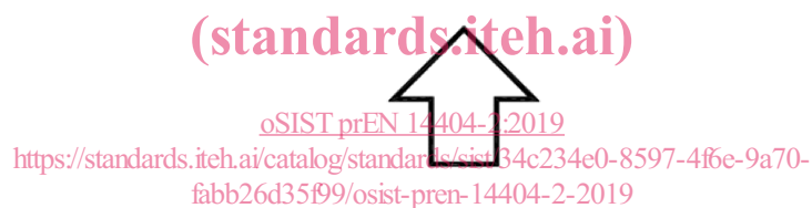
Figure 1 — Pictogram ISO 7000 - 1861 Indication for vertical alignment

The marking below (Figure 1) shall be used on the side facing the knee and pointing upwards.