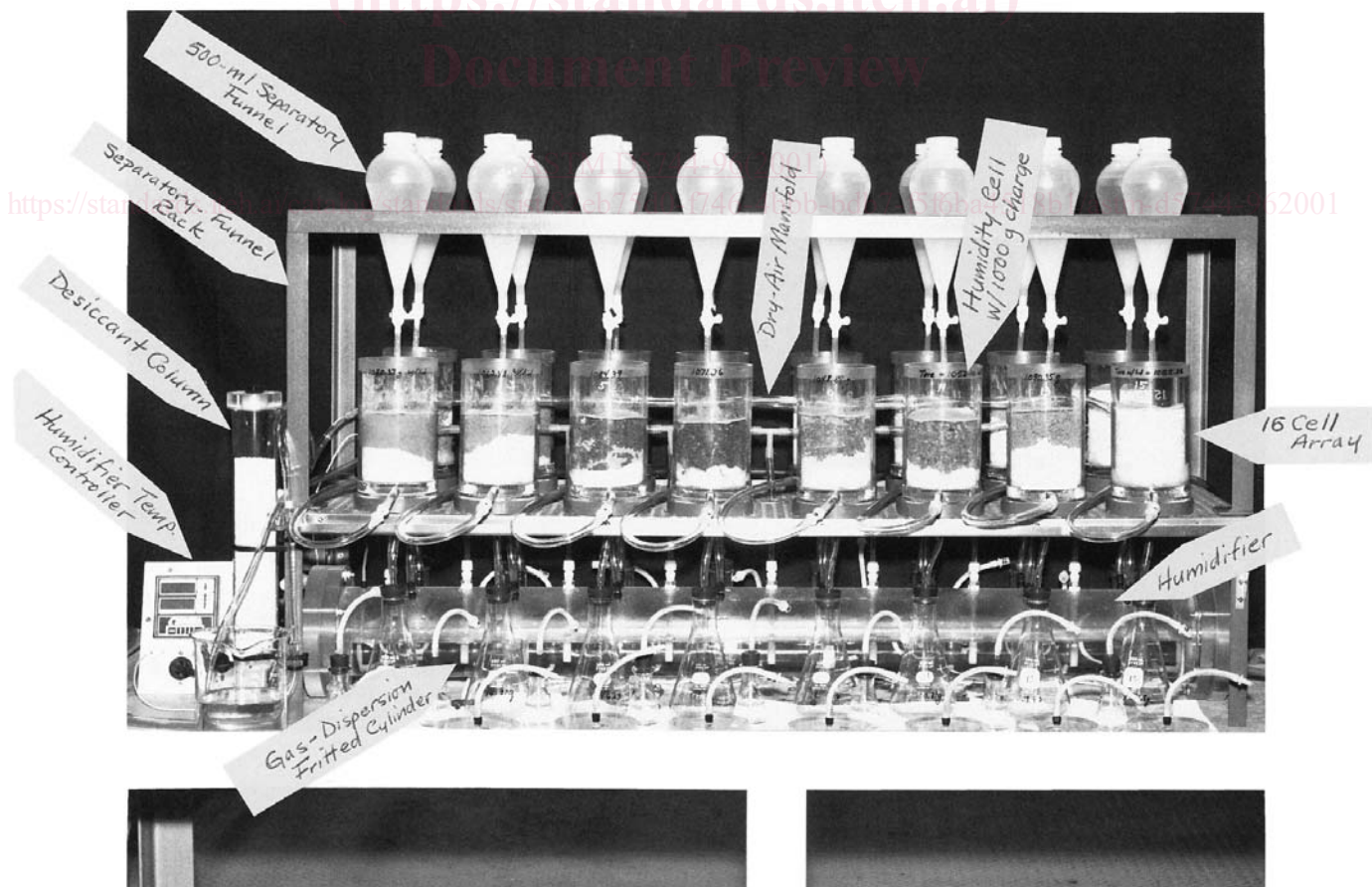
FIG. 2 Front View of 16-Cell Array with Separatory Funnel Rack

11.1.3 Cut the filter media (such as 12-oz/yd 2 polypropylene described in 6.11) to the humidity cell's inside diameter dimensions so that it fits snugly yet lies flat on the perforated support.