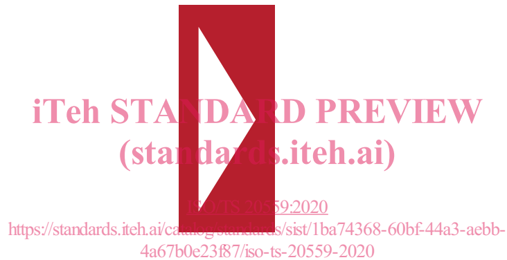
Figure 3 — Example of directional indicator for fire equipment

Supplementary directional indicators may be used in combination with fire equipment safety signs to communicate the location of the equipment (see Figures 3 and 4 ). To avoid confusion with directional guidance given by the arrows used on escape and safety way guidance route signs, ISO 3864-3 Type D arrows should not be used for indicating the direction to equipment.