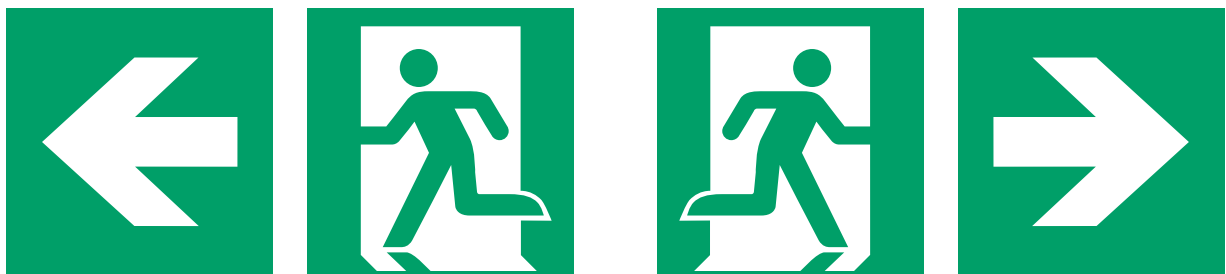
a) Supplementary arrow sign in combination with ISO 7010-E001 “Emergency exit (left hand)” b) Supplementary arrow sign in combination with ISO 7010-E002 “Emergency exit (right hand)”