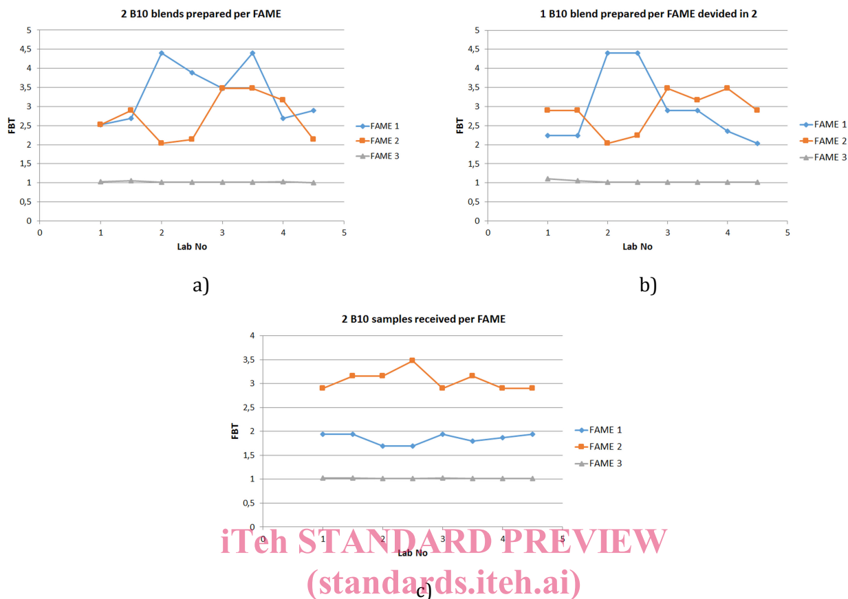
Figure 3 — Effect of B10 preparation https://standards.iteh.ai/catalog/standards/sist/4fc2897a-5879-40e0-95e1-94166a5e7e6c/sist-tp-cen-tr-17544-2020