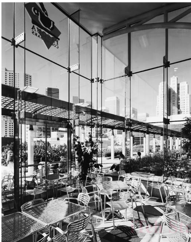
FIG. 6 Glass Mullion System