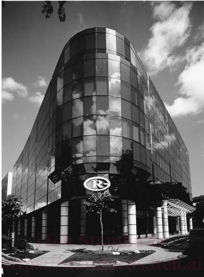
FIG. 3 Four-Side SSG System

glazing sealant, thus reducing the possibility of localized cracking of glass.