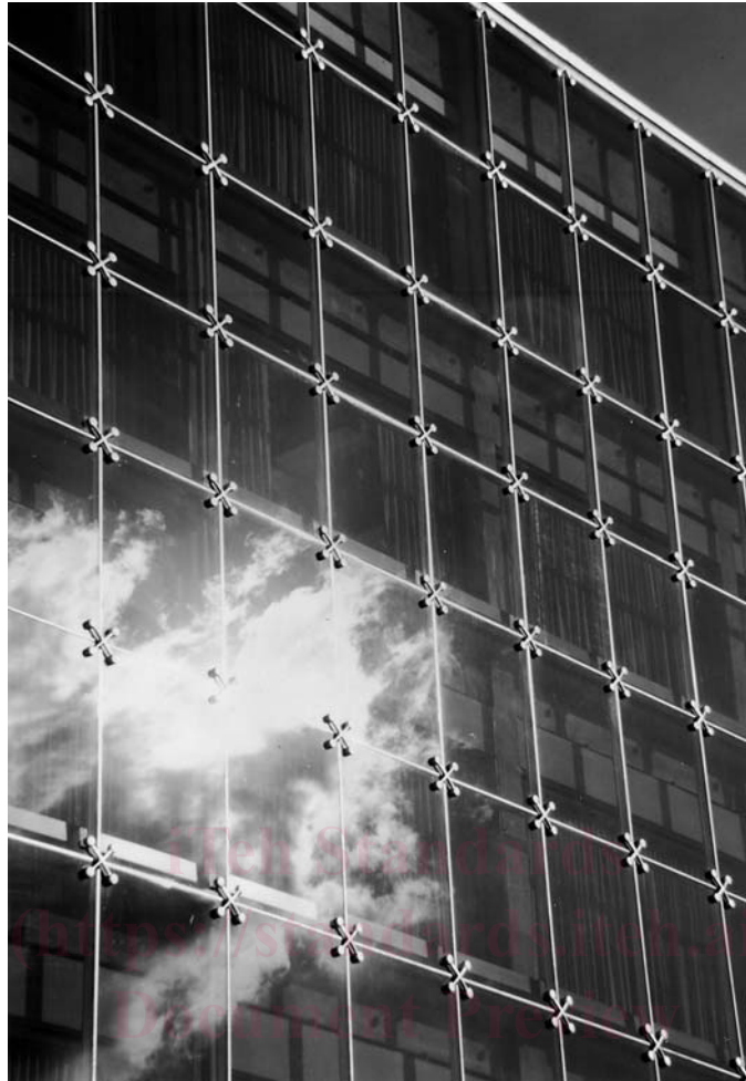
FIG. 4 Four-Side SSG System

attachment can be from the edge of the glass lite or panel to the side of a vertically projecting fin of a metal framing member. This is acceptable if the glass lite or panel and the size of the structural joint have been determined to be adequate by structural calculation.