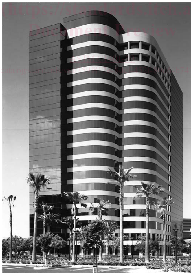
FIG. 2 Two-Side SSG System

16.3.2 A four-side SSG system can provide the aesthetic appearance of an all-glass or panel facade with no visible metal parts and relatively narrow sealant or other joints between panels. With no exposed metal parts and completely sealed joints, these systems can be very energy efficient compared to conventional metal and glass curtain wall or window systems. They also can have a higher degree of risk than two-side SSG systems since they rely only on the adhesion of a structural sealant to retain the glass lites or panels. With no exterior metal mullion caps, thermal stressing of a glass lite is reduced since there is no shading of the glass edge by the cap, and wind load induced stressing of the lite is more evenly distributed to the metal framing system by a structural