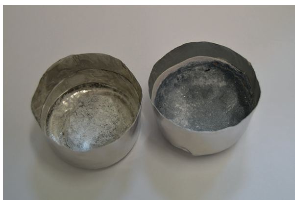
Figure 2 — Appearance of mixture prior to sintering (left) and after successful sintering (right)