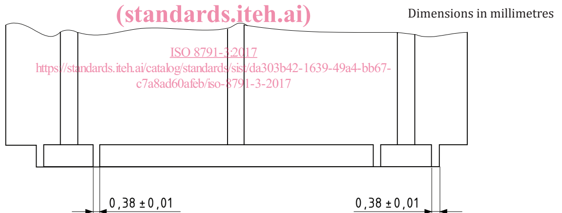
Figure 2 — Example of test assembly

The test assembly, an example of which is shown in Figure 2, shall include a detachable measuring head mounted so that it can be brought into contact with a test piece placed on an optically flat plate.