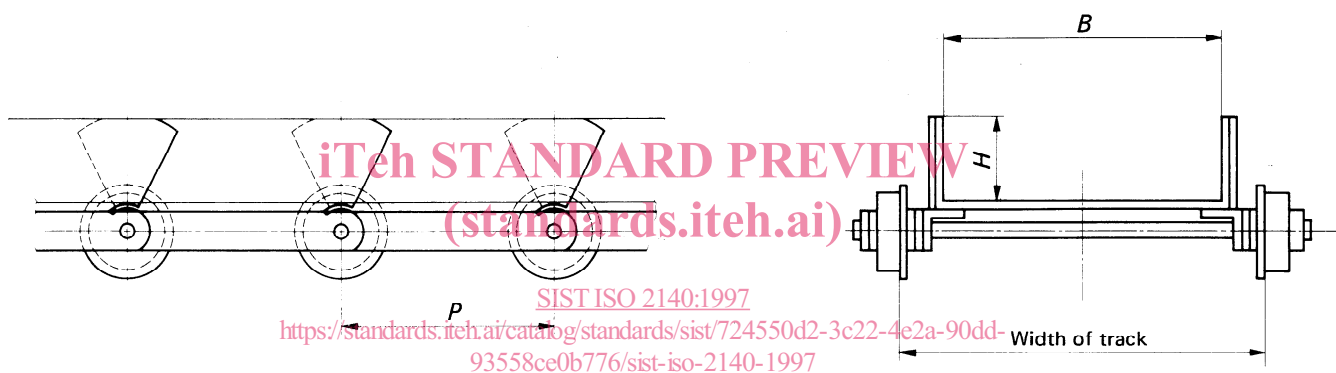
FIGURE 1 – General plan

This International Standard specifies the main dimensions concerning the construction of apron conveyors for loose bulk materials, namely : pitch of chain, width of apron, and height of cheek plates. Practical examples are given in figure 2.