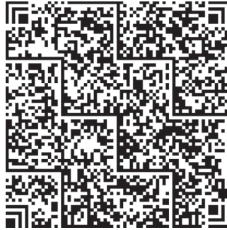
Figure 6 — Version 24 symbol