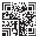
Figure 5 — Version 4 symbol