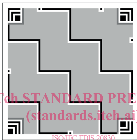
Figure 3 — Structure of a Version 24 Han Xin Code symbol