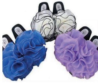
Figure 1 — Example of decorative attachment