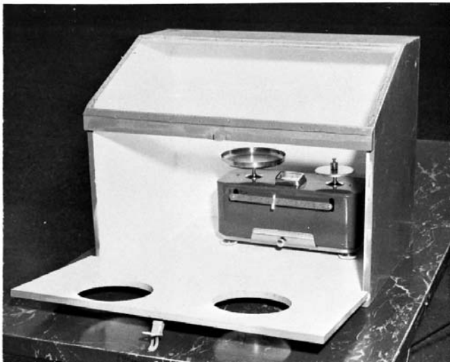
FIG. 1 Weighing Box and Balance