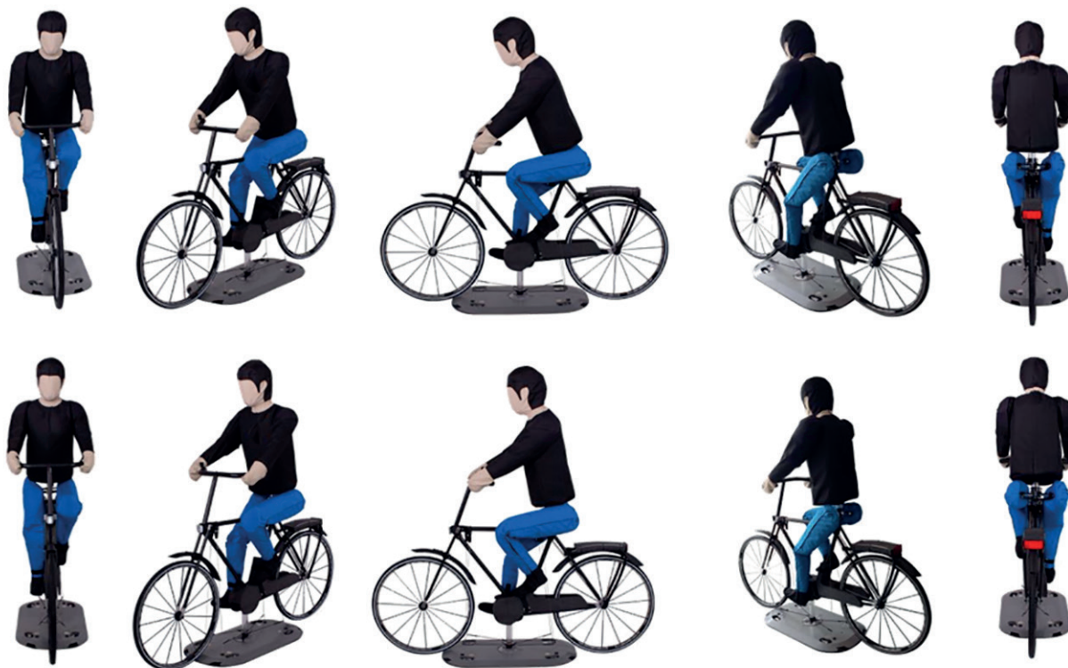
Figure 1 — Bicyclist target with different BT rider torso angles